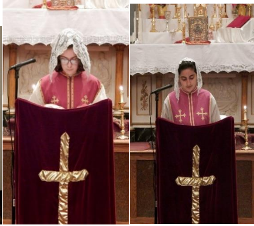
Armenian Christmas Eve