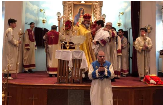
Godfather - Blessing of Water – Armenian Christmas