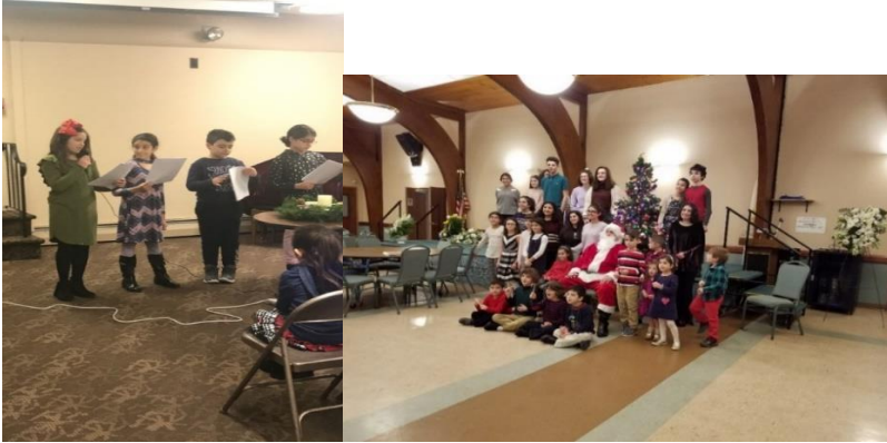
4 th Grade Advent Presentation, Annual Christmas Party in December